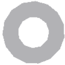
(12) 5/16" WASHERS