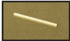
Coupler and drive pin

Drive pin needs to be cut down to fit per your application.