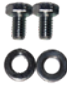
Passenger seat spacer bracket to floor bracket. (not used with under seat storage)